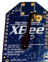
Xbee Pro S1