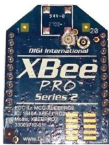
Xbee Pro S2